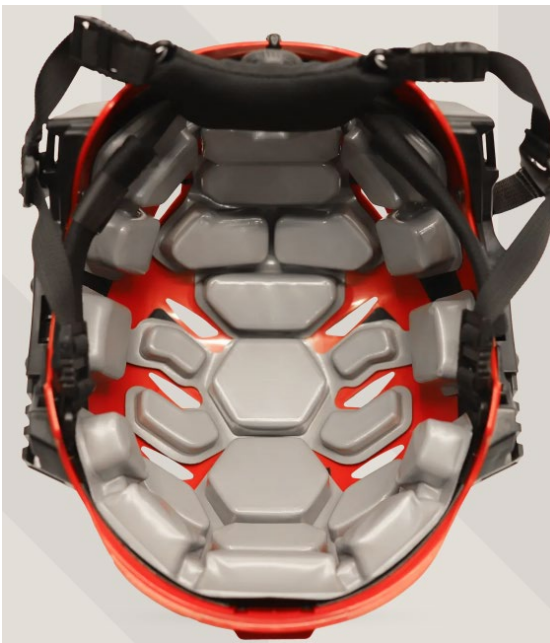
EXFIL Rescuer liner system (left) and EXFIL Maritime Rescuer liner system (right).